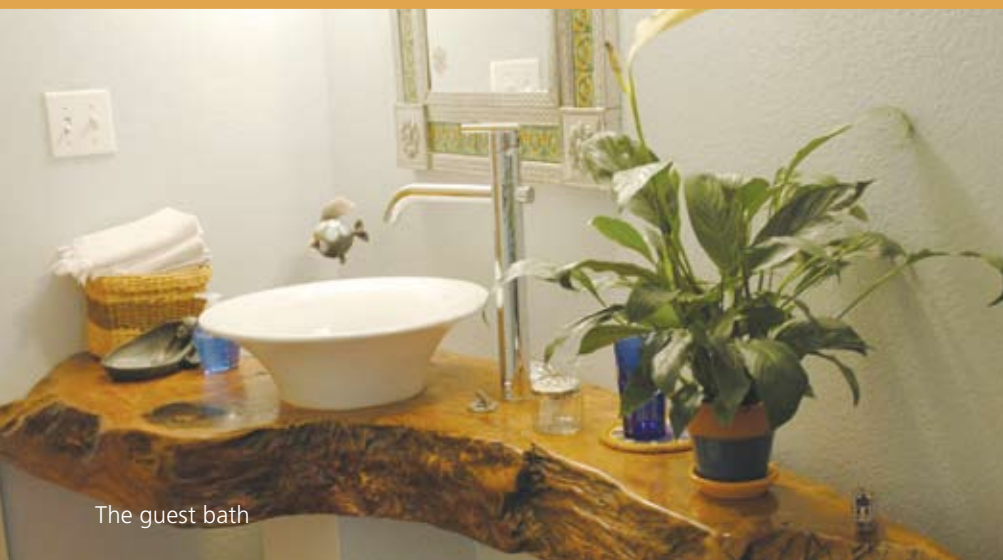
The guest bath