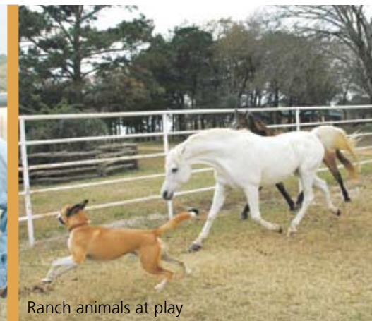
Ranch animals at play