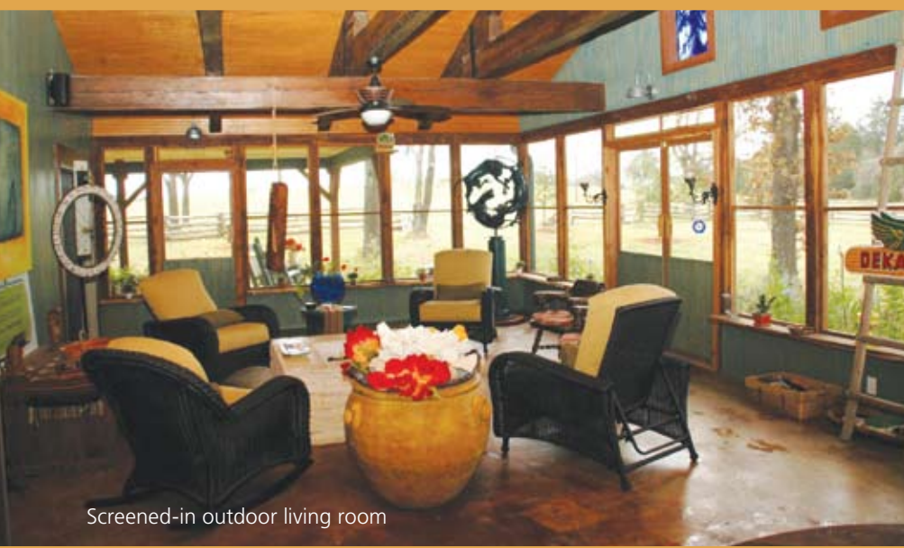
Screened-in outdoor living room