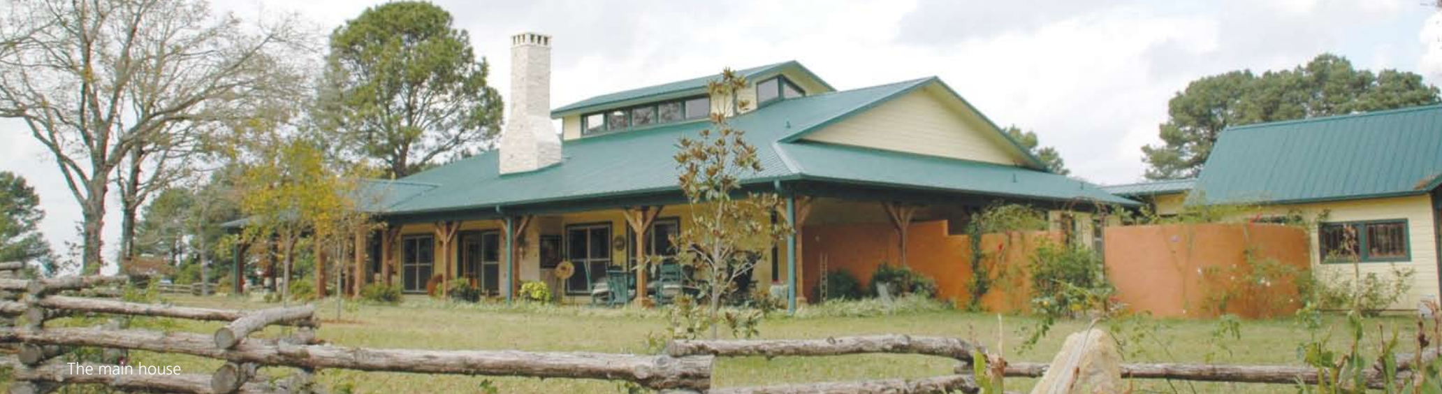
The main house